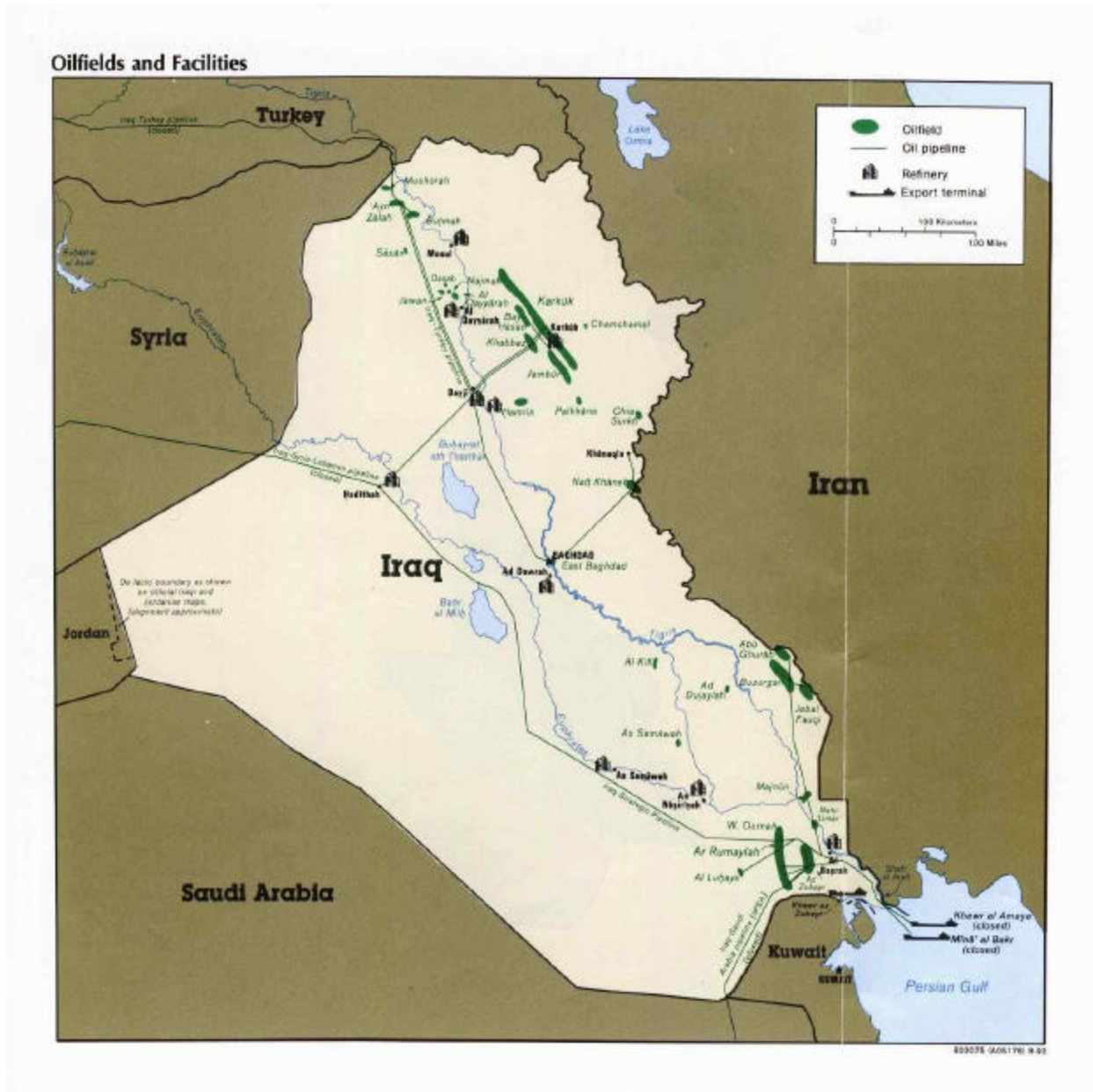
Figure 1: Central Intelligence Agency map provided by Iraq Research, August 1992, available online at http://www.iraqresearch.com/html/map/8.html .