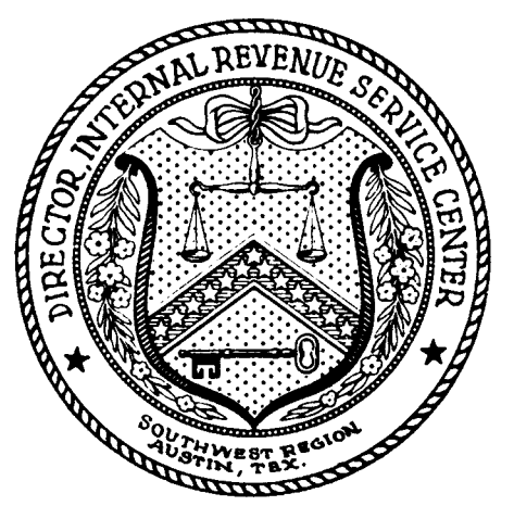
(ii) The offices of Director of Internal Revenue Service Center for which seals are established in subdivision (i) of this subparagraph are as follows:

(6) Directors of Internal Revenue Service Centers. (i) There is hereby established an official seal in and for each of the offices of Director of Internal Revenue Service Center listed in subdivision (ii) of this subparagraph. The seal is described as follows, and one such seal is illustrated below: A circle within which shall appear that part of the seal of the Treasury Department represented by the shield and side wreaths. Exterior to this circle and within a circumscribed circle in the form of a rope shall appear in the upper part the words "Director, Internal Revenue Service Center" and in the lower part the name of the region and the name of the principal city in or near which the service center is located.