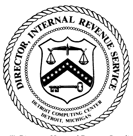
(8) Director of Internal Revenue Compli ance Center. There is hereby established in and for the office of the Director of

(7) Director of Internal Revenue Computing Center. There is hereby established in and for the office of the Director of the Internal Revenue Computing Center an official seal. The seal is described as follows, and illustrated below: A circle within which shall appear that part of the seal of the Treasury Department represented by the shield. Exterior to this circle and within a circumscribed circle in the form of a rope shall appear in the upper part the words "DIRECTOR, INTERNAL REVENUE SERVICE" and in the lower part "Detroit Computing Center Detroit, Michigan''.