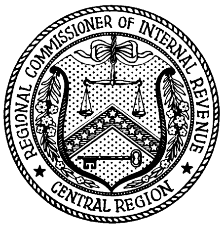
(ii) The offices of the Regional Commissioner of Internal Revenue for

(5) Regional Commissioners of Internal Revenue. (i) There is hereby established an official seal in and for each of the offices of Regional Commissioner of Internal Revenue listed in subdivision (ii) of this subparagraph. The seal is described as follows, and one such seal is illustrated below: A circle within which shall appear that part of the seal the Treasury Department of represented by the shield and side wreaths. Exterior to this circle and within a circumscribed circle in the form of a rope shall appear in the upper part the words "Regional Commissioner of Internal Revenue'' and in the lower part the title of the region for which the seal is established.